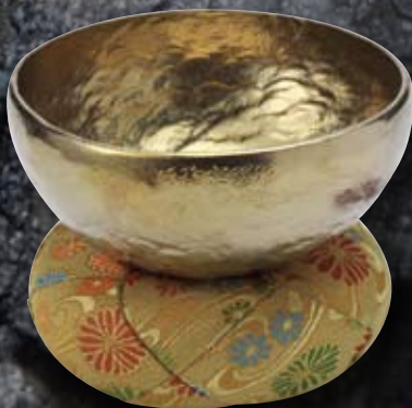
Titanium Buddhist bell

Joint development of the gong sound source for the Seiko watch "minute repeater"