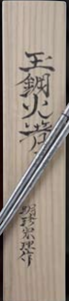
Tamahagane Fire Chopsticks